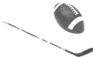
Football and ice hockey are full-contact sports. High school life is not.

by all, and the marriage bed kept pure, for God will judge the adulterer and all the sexually immoral" (Hebrews 13:4). When casual physical intimacy is present outside of relationships, it loses its meaning. Suddenly, it's no big deal anymore. If physical intimacy were to be saved for only when you were in a relationship with